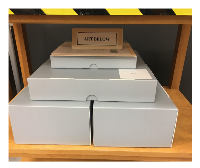
Fig. 10: Heritage® board protective enclosures for volumes containing photographs

Providing protective enclosures for albums made from Heritage® or other similarly tested board (fig. 10), (rather than housing them in cloth-covered drop spine boxes), ensuring that storage and exhibition materials have passed the Oddy test and Photographic Activity Test, and maintaining a stable environment during storage, research, and display will result in