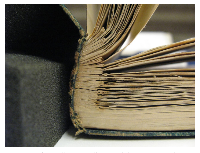
Fig. 2: Traditionally sewn album with leaves removed to accommodate addition of photographs to textblock. Author's study collection object

Bookbinders accommodated the addition of the photographs into the pages of traditionally sewn books in various ways and altered the structures to account for the thickness of the new contents in manners similar to those employed to bind volumes with intaglio or woodblock prints. Initially, leaves were removed (fig. 2), folios were back-hooked and sections were sewn with compensation stubs, these stubs approximating the thickness of anticipated additional materials.