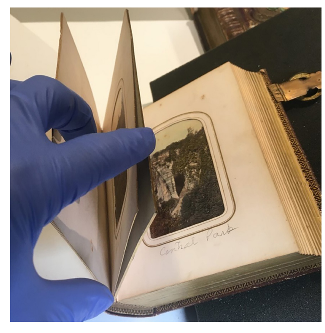
Fig. 8: Jackson, Ambrose; Stacy's Photographic Carte de Visite, Publisher, [Carte-de-visite Album of Central Park Views], 1860s. Paper facing lifting away from board

Numerous preservation challenges lurk in the pages of guarded leaf albums. The aforementioned concerns about 19<sup>th</sup> century papers, leathers, and adhesives must be considered, as the degradation patterns of these