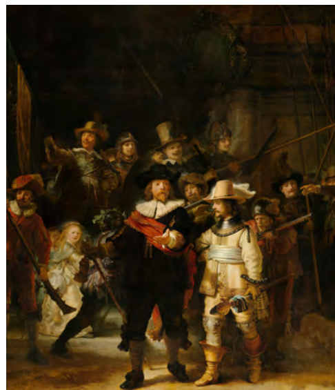
Rembrandt Harmensz van Rijn, The Night Watch (detail), 1642, Rijksmuseum, Amsterdam. On loan from the City of Amsterdam

This morning, head to the Rijksmuseum, the State Treasury of Dutch art for an expert-led tour. Marvel at works by Rembrandt, including the world-famous The Night Watch , as well as Vermeer, Frans Hals, and more. Then transfer to a canal boat for an introductory cruise through this historic city—including its iconic bridges, waterfront houses, and historic canals recognized as a UNESCO World Heritage Site—accompanied by an art historian. This afternoon, embark Magnifique III . B, L, D