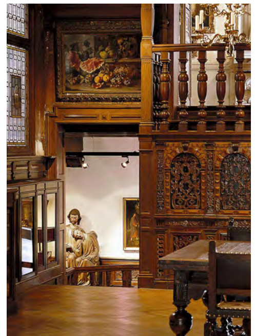
Museum Mayer van den Bergh, Antwerp