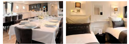
Guests dining aboard Magnifique III (top); Upper deck suite (above right); and dining room (above left)

Launched in 2018 as a beautiful passenger barge, Magnifique III features 21 contemporary cabins. The upper deck has five spacious suites (172 sq.ft.) with two separate single beds, a small sitting area, and a "French balcony" featuring ceiling-to-floor sliding-glass doors. The lower deck has fourteen beautiful twin cabins (129 sq.ft.) with two separate single beds and two single cabins. The upper deck has a large, tastefully furnished salon with a restaurant area, a nice bar, and a lounge area with cozy sitting corners, a wide screen TV, and large panoramic windows. On the top deck, the barge has a whirlpool/Jacuzzi and some deckchairs to relax and enjoy the scenery while cruising.